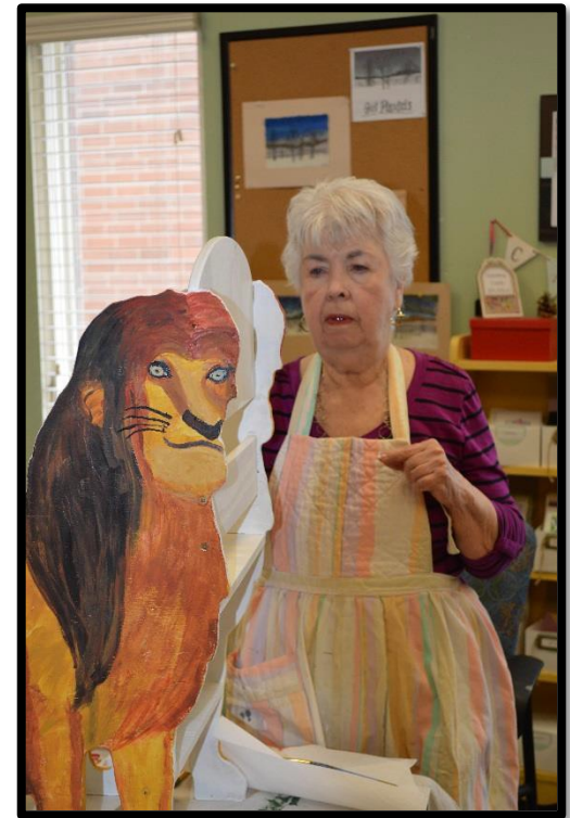
Painting chairs for delivery to an underserved Kindergarten.

Throughout the history of Friendship Village Chesterfield, the organization has made a commitment to give back to the communities it serves. Located in Chesterfield, Missouri, the organization is home to more than 450 seniors and employs more than 250 people from the St. Louis metropolitan region.