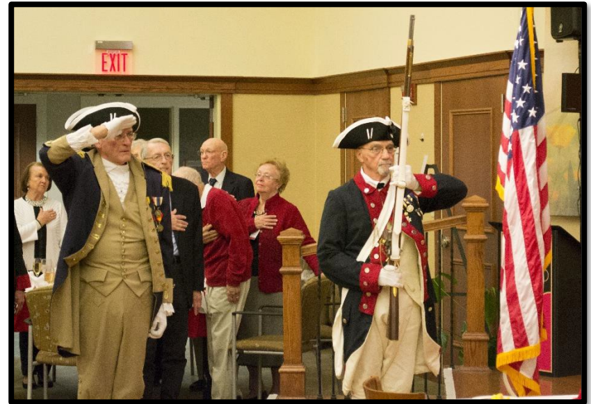
Local reenactors assisting with community veterans ball