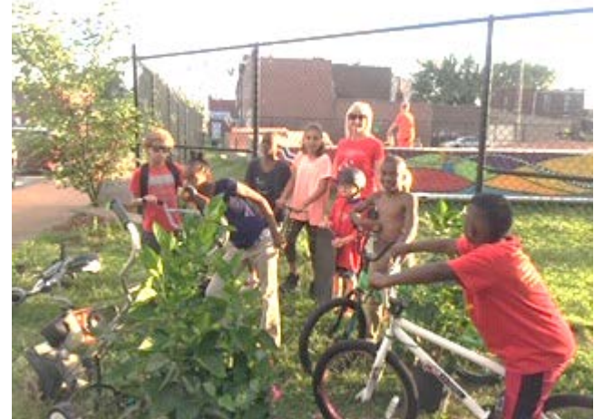
Students help maintain perennial garden planted by FVC residents and staff