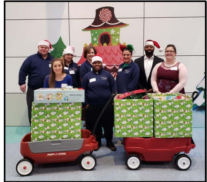
Employees delivered gifts from toy drive to Ranken Jordan Pediatric Bridge Hospital

The employees of Friendship Village Chesterfield go above and beyond their work load. Our employees continue to serve in various neighborhoods and community projects across the St. Louis metropolitan area.